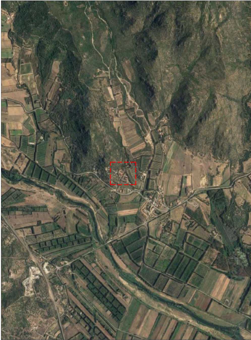
INQUADRAMENTO TERRITORIALE SCALA 1:10 000